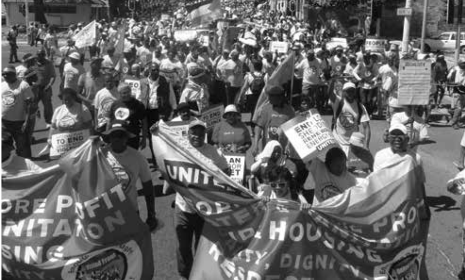
United Front march on Budget Day.