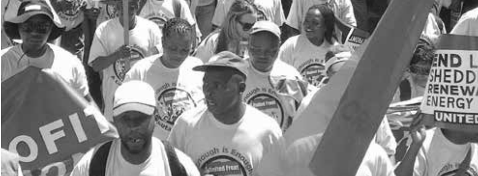
United Front march on Budget Day.