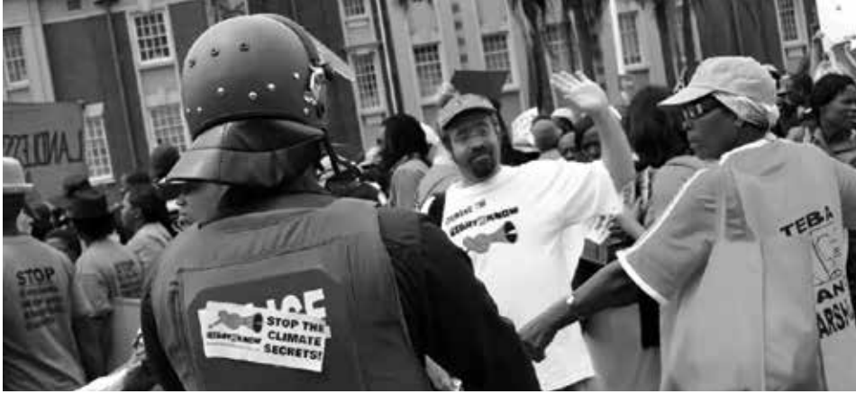
Riot police at the climate justice march in Durban during COP17, 2011