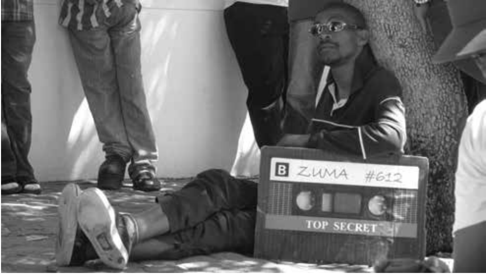
R2K camp-out at the gates of Parliament.