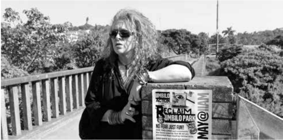
Vanessa Burger.