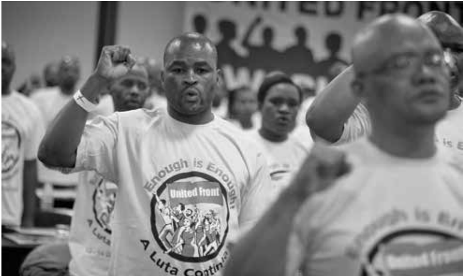
The United Front 'preparatory assembly'.