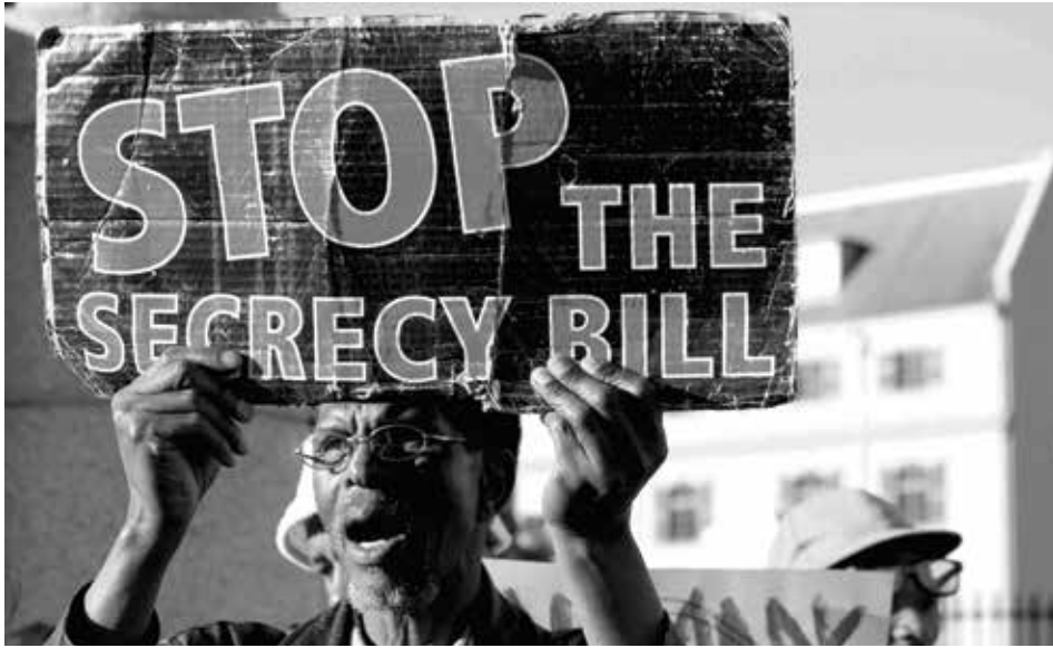
R2K camp-out at the gates of Parliament, 2012.