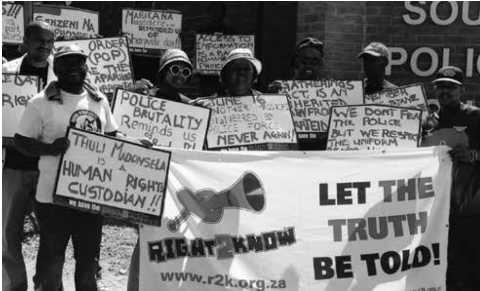
Right2Know KZN picket of Chatsworth police station, 2015.