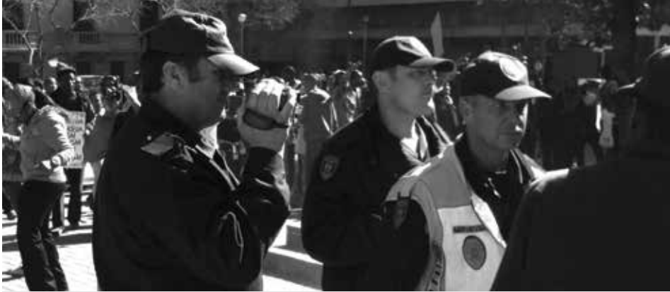
Police taking video at a protest against hate crimes in Johannesburg, 2011.